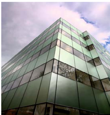
Mercè Rodoreda bldg, seen from carrer Ramon Turró