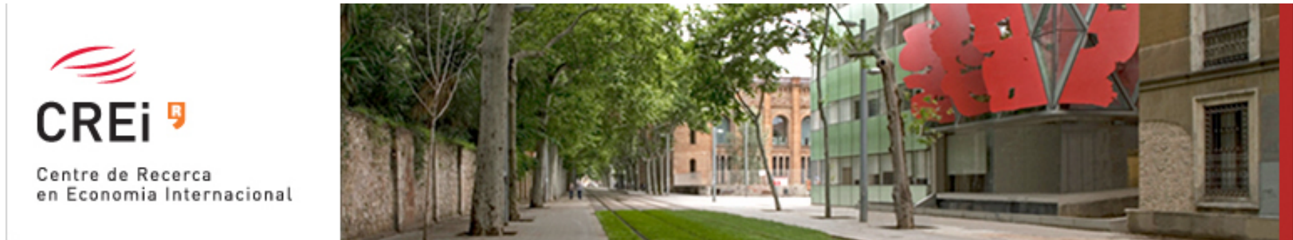
↑ CREI's glass building (on the left) seen from Wellington street

The Lectures will be held in room 23.S05 .